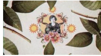
Hypocritic (Official Video)