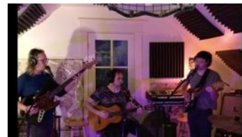
WNRN Radio Home Studio Session