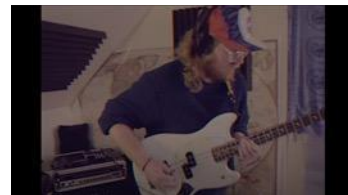
"Are You Gonna Be Okay" (Live in our home studio)