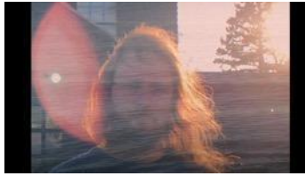
Best Kind of Moment (Official Video)