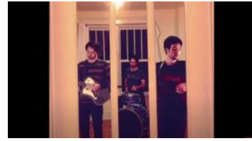
How Come? (Official Video)