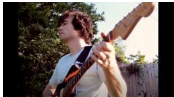
"These Days" (Live in our garden)