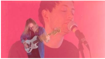
Perfectly Out Of Time (Official Video)