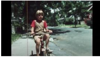
Orange Days (Official Video)