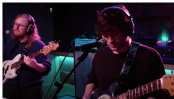
Audiotree Live Session